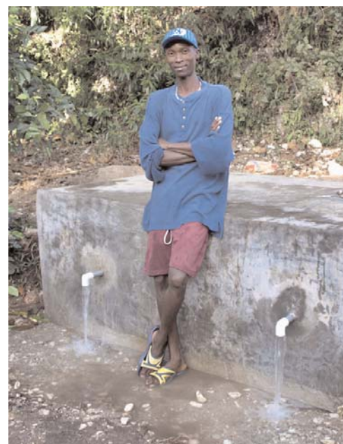
Our mason shows off the completed Veilot spring