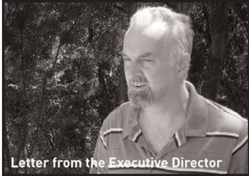
Letter from the Executive Director

Literacy Tree Nurseries Clean Water Ministry Animal Husbandry Agriculture