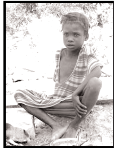
Photo - This child's family lost their home and gardens. I visited them on my first trip up to see the damage. All they had to eat was 4" stunted corn that they had gleaned from their ravaged garden. They had it boiled in the morning and were roasting it when we passed by in the afternoon. We gave them uncooked food in Verrettes the next day to take home. I so wanted to take the two children home with me but Ficilita disagreed. Looking back, I know that she was right. I chose to not go any farther that day.